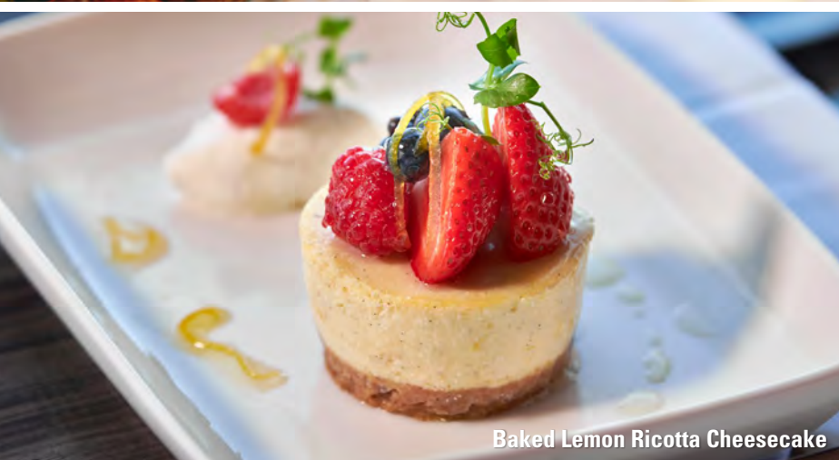
Baked Lemon Ricotta Cheesecake