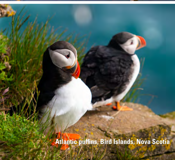
Atlantic puffins, Bird Islands, Nova Scotia

Our 2025 Canada & New England season features more late-night stays than ever before! Spend more time admiring Portland's Victorian houses, Newport's grand mansions, Nova Scotia's picture-postcard villages and so much more. You can also visit the oldest lighthouses in Maine and Prince Edward Island as well as the only one that's shared between the United States and Canada.