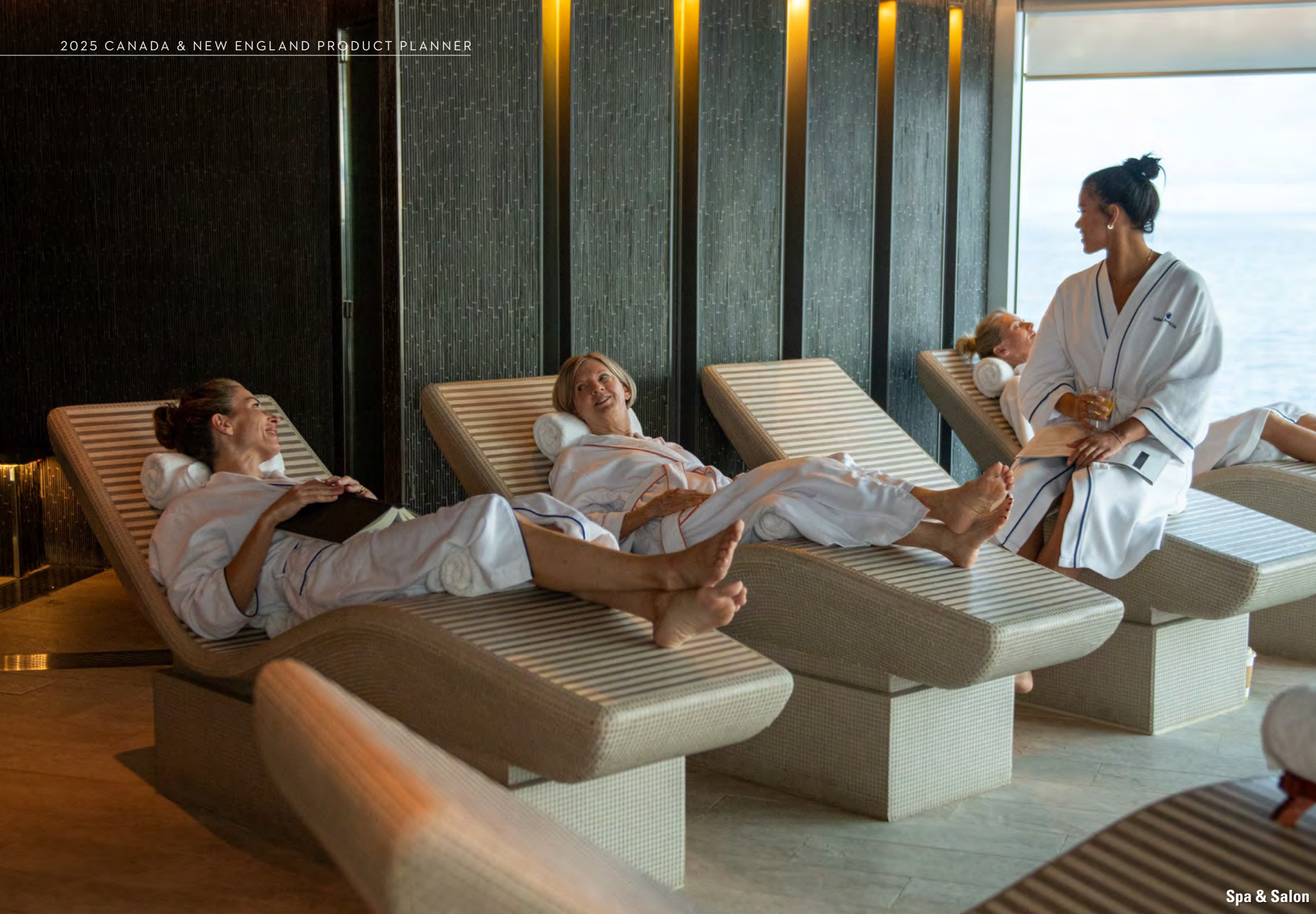
Spa & Salon