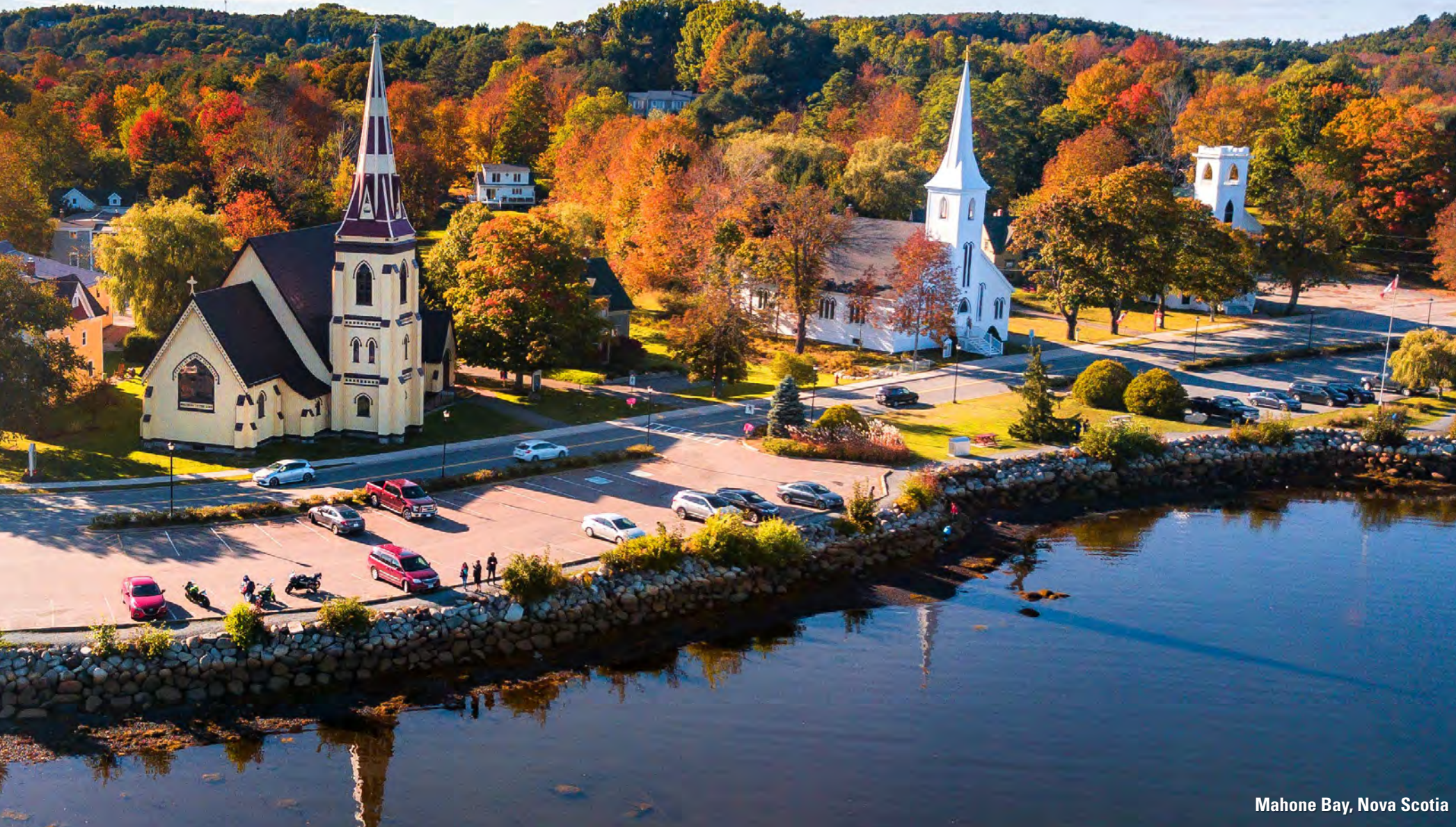
Mahone Bay, Nova Scotia