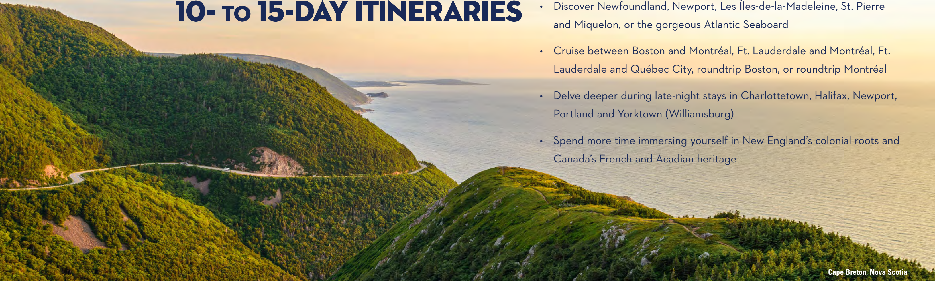
Cape Breton, Nova Scotia