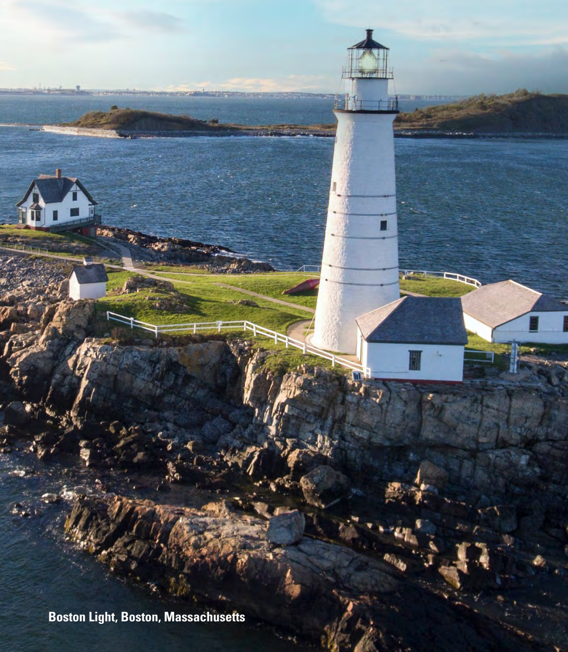
Boston Light, Boston, Massachusetts

Past meets present in Canada & New England's major cities. Admire natural and man-made marvels, taking in fall foliage and gorgeous architecture alike on our September/October sailings. Stroll historic cobblestone streets, 17th-century ramparts, or old-stone alleys en route to Boston's Bull & Finch Pub (the inspiration for the TV show Cheers ), Québec City's trendy Grande Allée thoroughfare, or Montréal's dynamic downtown core.