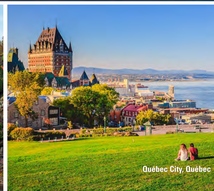
Québec City, Québec