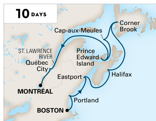
10 DAYS NEW ENGLAND, NEW FRANCE & NEWFOUNDLAND: CORNER BROOK BOSTON TO MONTRÉAL Volendam Aug 6