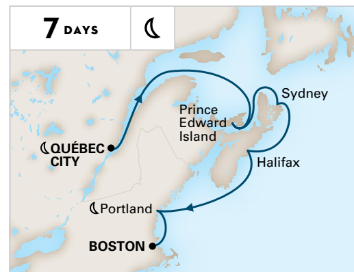
Bay of Fundy, New Brunswick