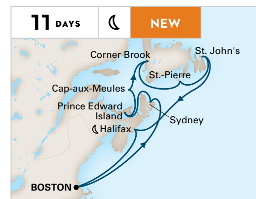
11 DAYS NEW CANADA & NEW ENGLAND CIRCLE: ACADIA & NEWFOUNDLAND ROUNDTRIP BOSTON Volendam Jul 1