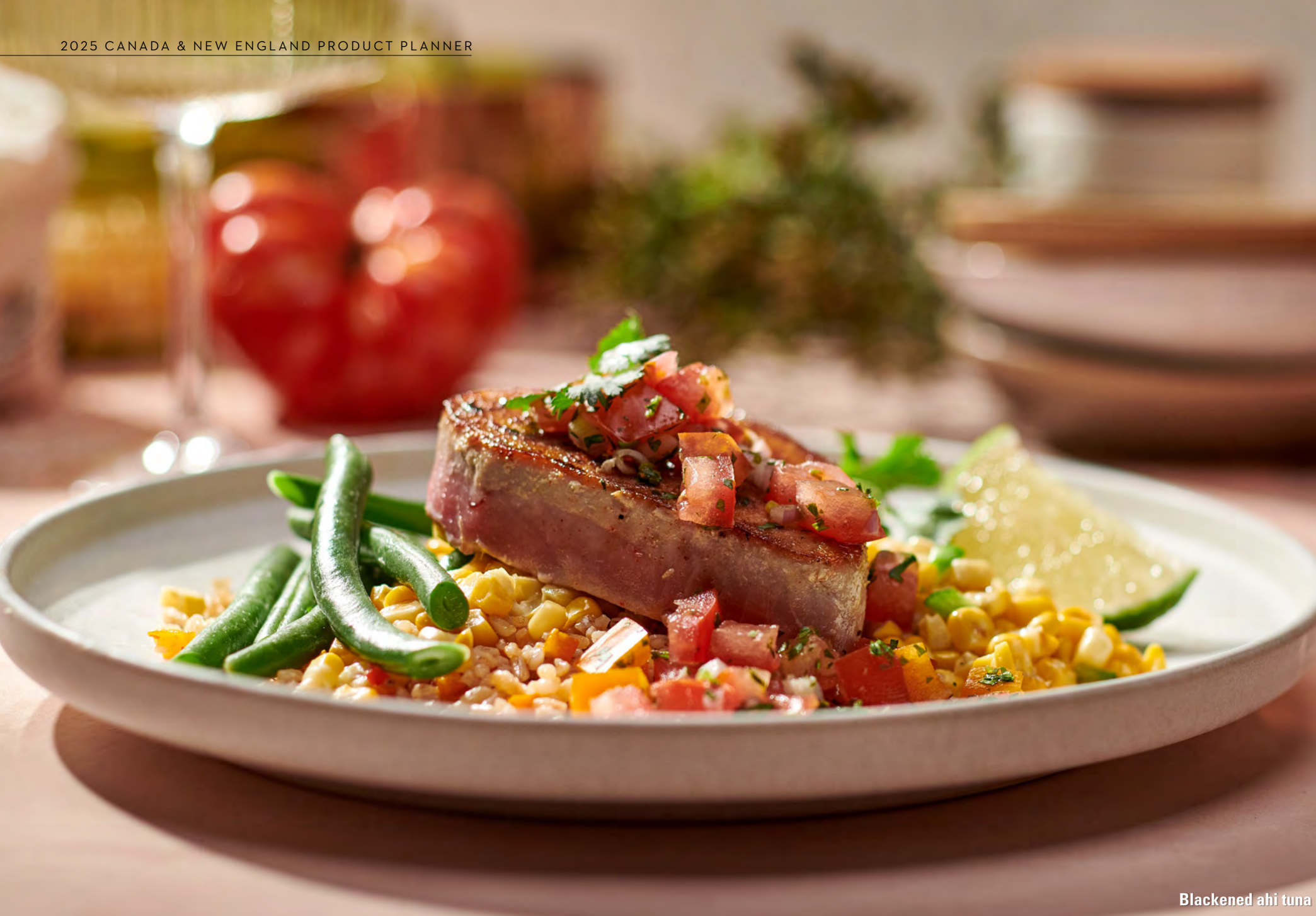
Blackened ahi tuna