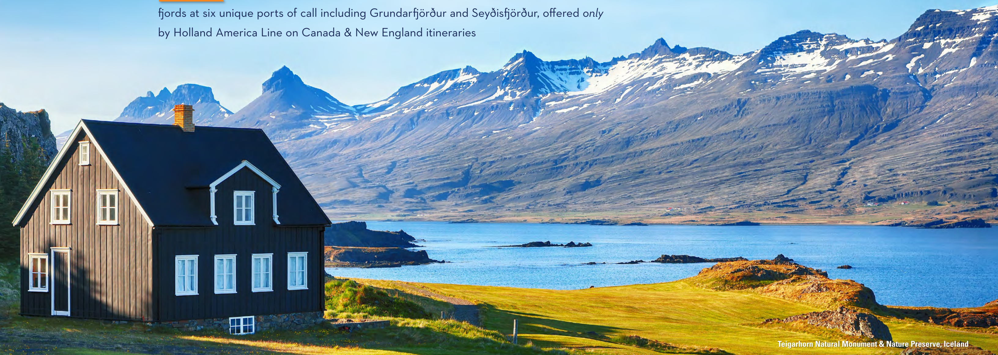
Teigarhorn Natural Monument & Nature Preserve, Iceland