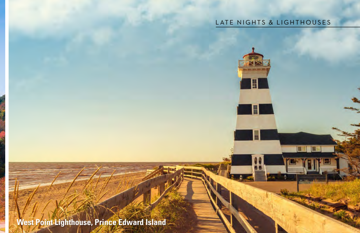
West Point Lighthouse, Prince Edward Island