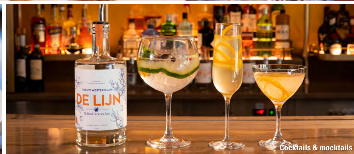
Cocktails & mocktails