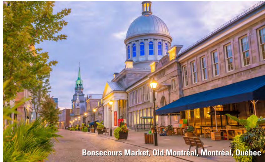
Bonsecours Market, Old Montréal, Montréal, Québec