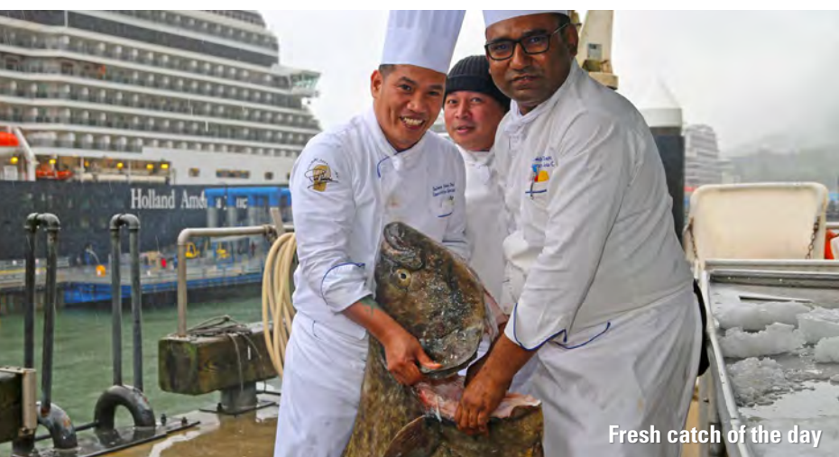
Fresh catch of the day

Looking for even more authentic tastes of the region? Our immersive shore excursions include a number of fun and delicious culinary tours. Sample New England clam chowder, Boston baked beans, lobster rolls, poutine, freshly shucked oysters and other tasty tidbits.