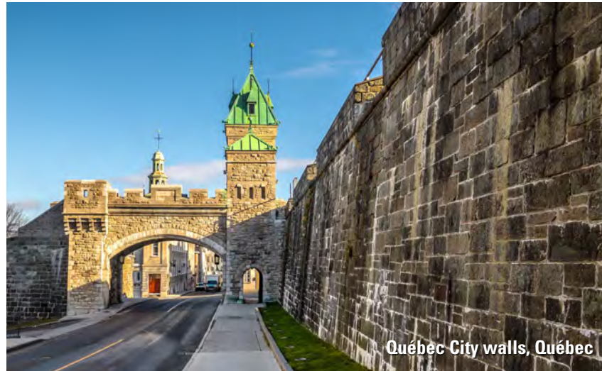
Québec City walls, Québec