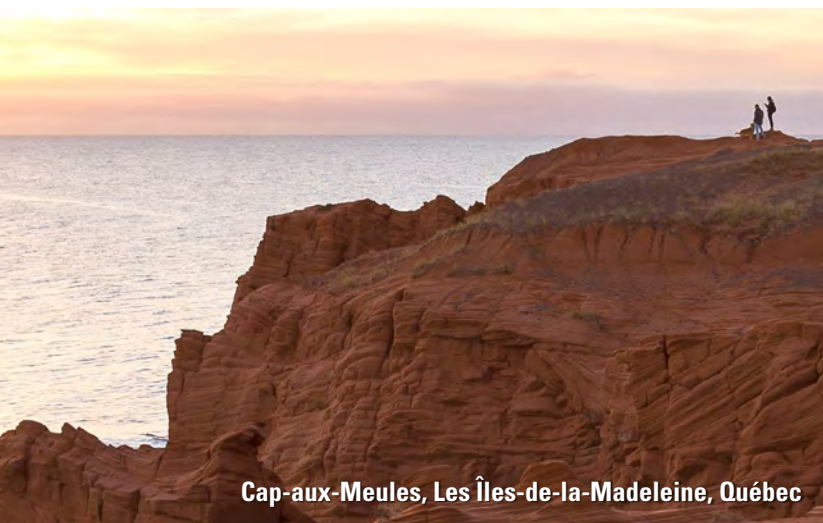
Cap-aux-Meules, Les Îles-de-la-Madeleine, Québec

Did you know that the 1781 "Siege of Yorktown" is widely considered the decisive battle that led to the American Continental Army's victory over the British? Admire Yorktown's lovingly preserved colonial homes and historic battlefields or transport yourself back to the 18th century in Colonial Williamsburg – the U.S.'s largest outdoor educational living museum that keeps alive the story of American independence.