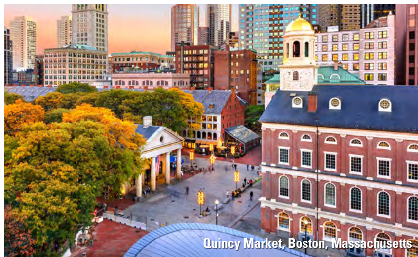
Quincy Market, Boston, Massachusetts