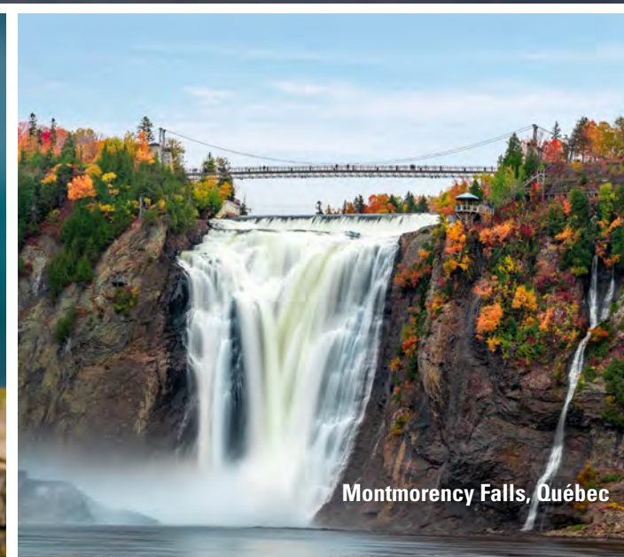
Montmorency Falls, Québec