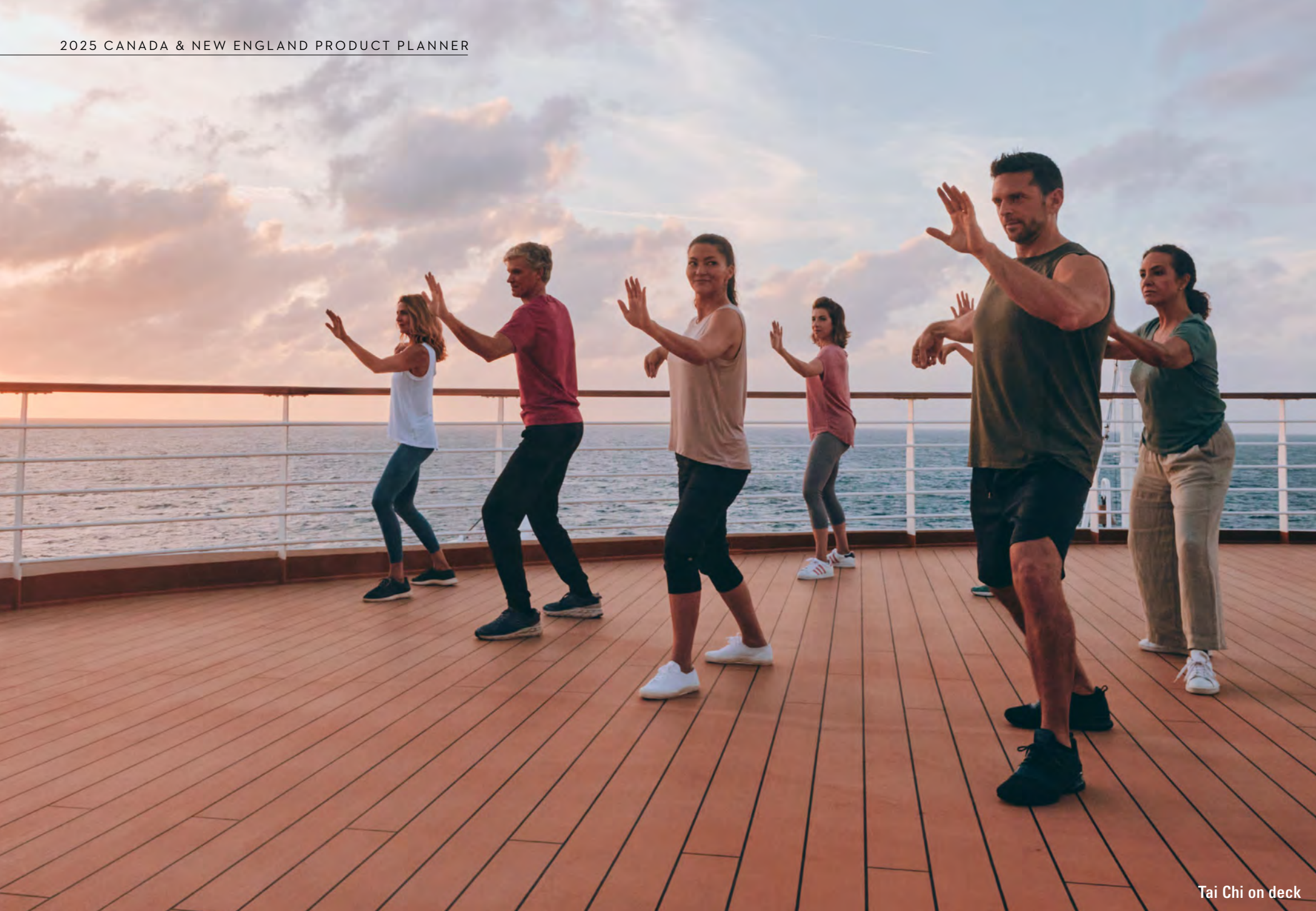
Tai Chi on deck