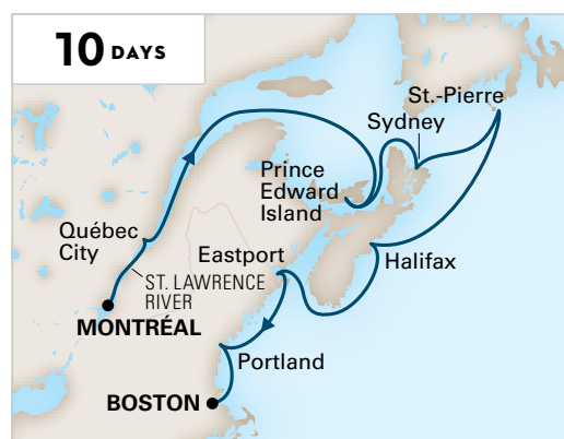
10 DAYS CANADA & NEW ENGLAND: MONTRÉAL, NEW FRANCE & MAINE MONTRÉAL TO BOSTON Volendam Jun 21