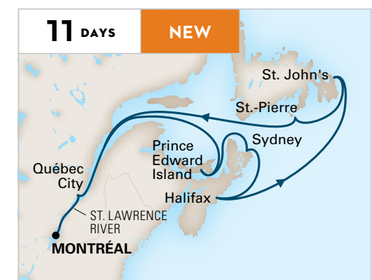
11 DAYS NEW CANADA & NEW ENGLAND CIRCLE: NEWFOUNDLAND & MONTRÉAL ROUNDTRIP MONTRÉAL Volendam Aug 16